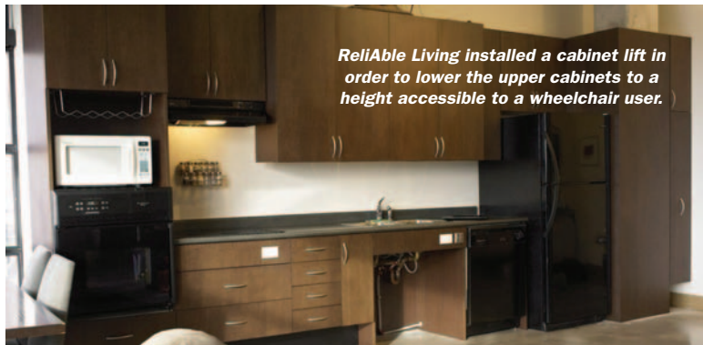
ReliAble Living installed a cabinet lift in order to lower the upper cabinets to a height accessible to a wheelchair user.

For more information, you can call Cathy Marchese at 800-667-6746 or email cmarchese@schluter.com or you can download the registration form here: http://www.schluter.com/media/education/WORKSHOP-TORONTO-2009.pdf