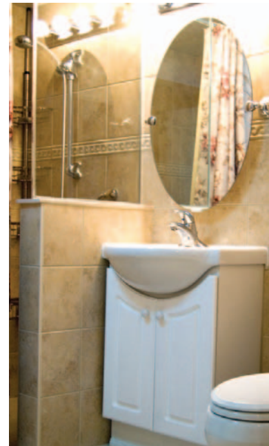
Barrier free washroom including ReliAble's Euromax Shower using Schluter Systems Kerdi shower tray and waterproof membrane.

As the population ages, new buildings need to be designed to accommodate the mobility challenges of seniors and handicapped people and existing buildings must be retrofitted. Reliable Independent Living Services provides comprehensive consulting resources and solutions to building owners, architects and contractors seeking practical and cost-effective answers.