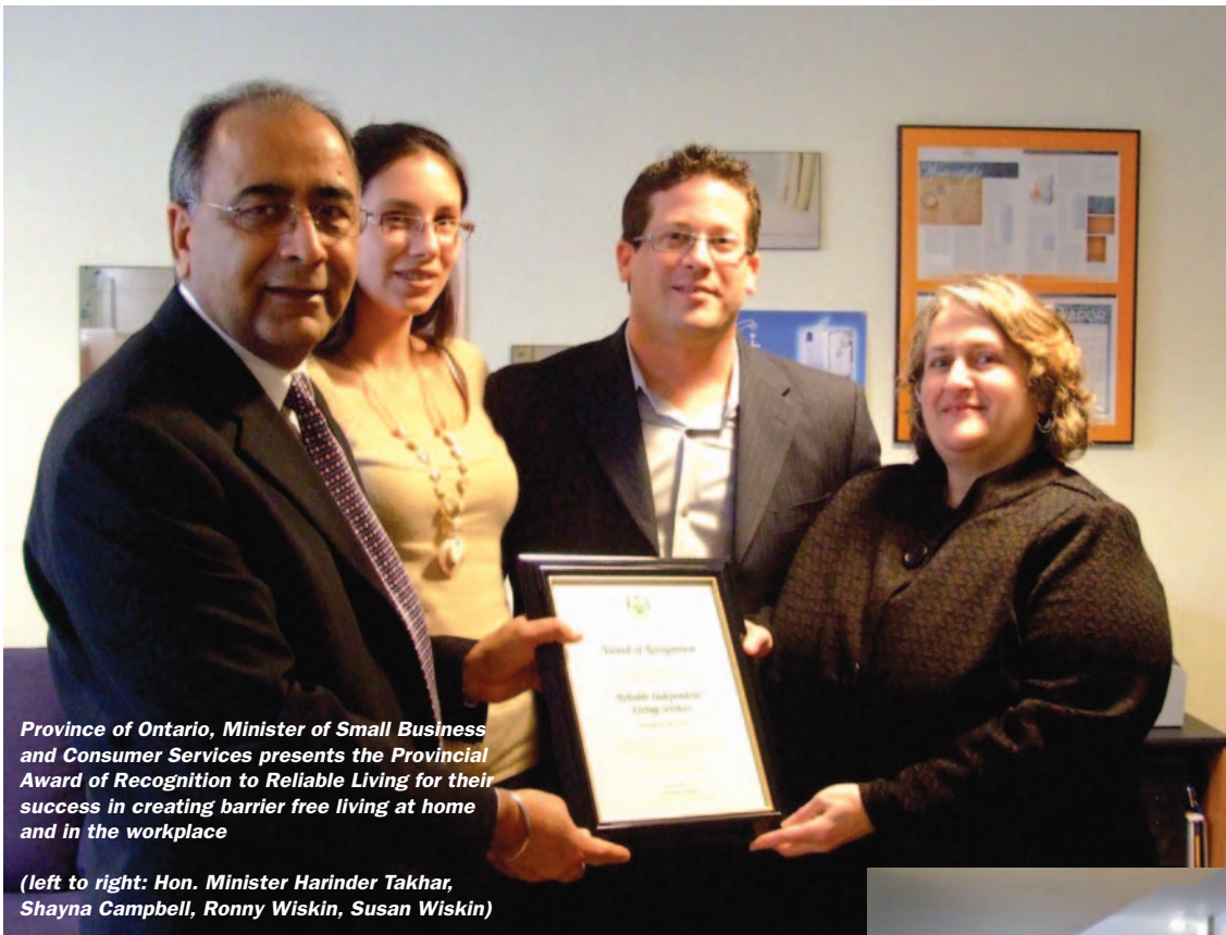
Province of Ontario, Minister of Small Business and Consumer Services presents the Provincial Award of Recognition to Reliable Living for their success in creating barrier free living at home and in the workplace

STAFF WRITER – The GTA Construction Report Special Feature