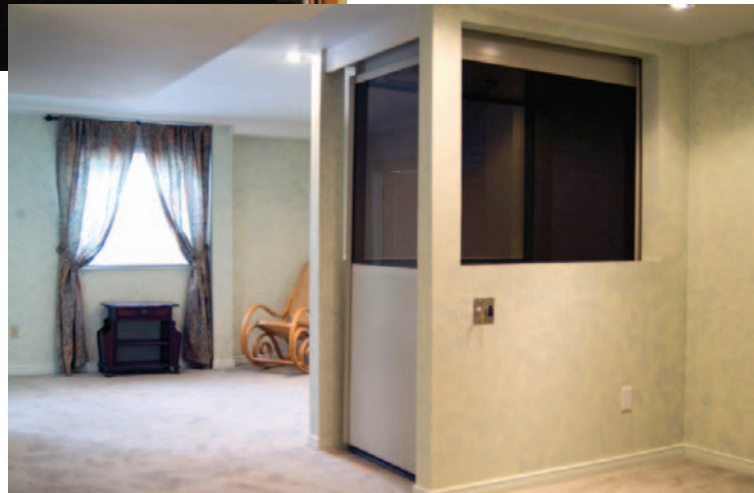
Barrier free residential two storey Telecab elevator installed by ReliAble Living provides complete access for the disabled parents of the home owners.