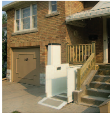
Wheelchair lift installed by ReliAble Living provides the home owners with wheel chair access into their home.

"We can assess the planned or existing building, and make suggestions about how to comply with the provincial legislation at the most economical cost," he said. "This