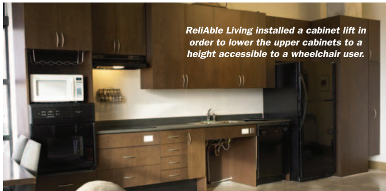
ReliAble Living installed a cabinet lift in order to lower the upper cabinets to a height accessible to a wheelchair user.

For more information, you can call Cathy Marchese at 800-667-6746 or email cmarchese@schluter.com or you can download the registration form here: http://www.schluter.com/media/education/WORKSHOP-TORONTO-2009.pdf